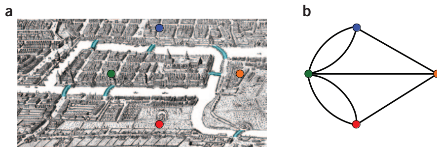
Figure 1 Bridges of Königsberg problem. (a) A map of old Königsberg, in which each area of the city is labeled with a different color point. (b) The Königsberg Bridge graph, formed by representing each of four land areas as a node and each of the city's seven bridges as an edge.

Since Euler's original description, the use of graph theory has turned out to have many